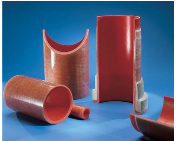
Dual laminated Liner-Pipes made of PVC-U (troisdorfred)

PVC-U troisdorfred, PVC-C, PP-H (BE 60), PP-2222, and other materials such as DEKATEC PPS, PVDF and ECTFE on request.