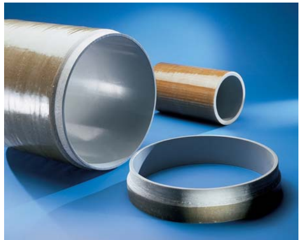
Dual laminated Liner-Pipes made of PVC-C